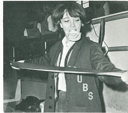
This could get to be quite a sticky subject.