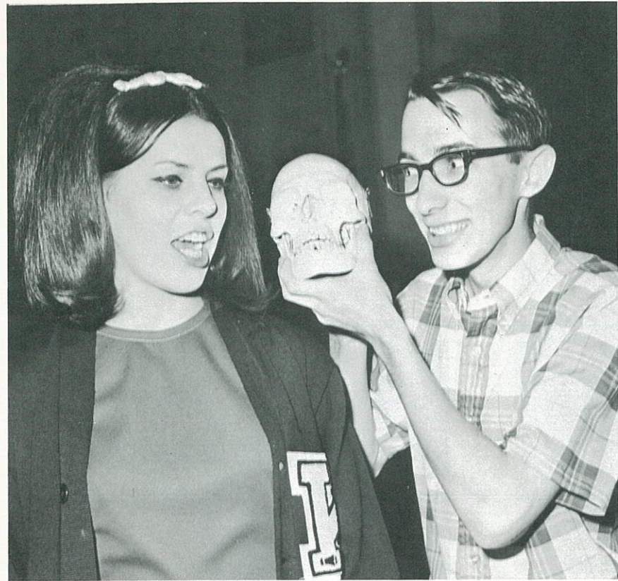
"Aw, come on, give him a little kiss." "Ugh!"