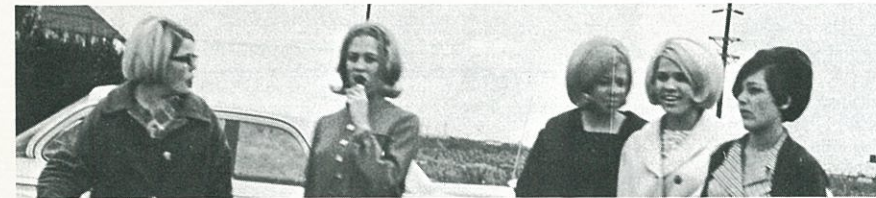
These are just a few of our fine intelligent students we have here in K.H.S.